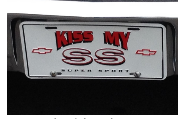
Bow Tie Cool & Super Sport Attitude!

The Hub Newsletter needs your pictures and reports of car shows and events you attend.